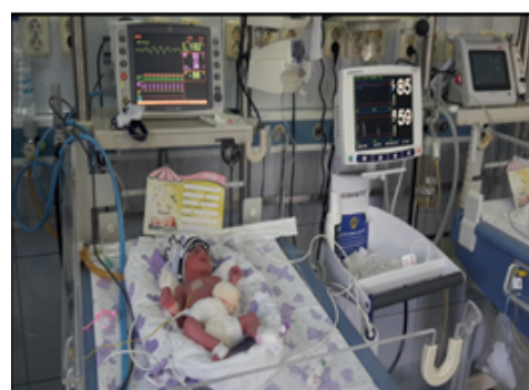
Fig. 1.RI to anterior cerebral artery/pericallosal artery using cerebral ultrasound in the first 7 days of life